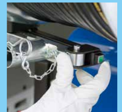
Electric locking mechanism for easy pivoting supplied as standard

VISIT US AT WWW.RIONED.COM FOR MORE INFORMATION