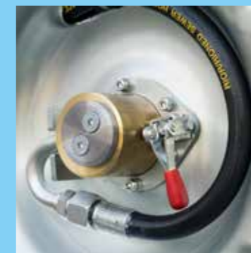
RioFree mechanical freewheel at the hose reel for coiling off without any resistance