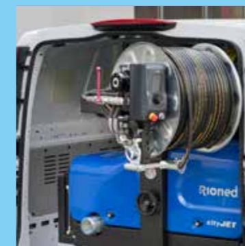
Wide 180° pivoting hose reel for max. 140 metres of 1/2" hose