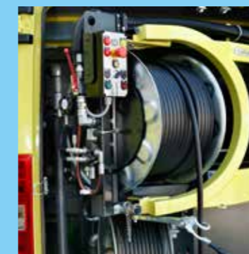
Pivoting and rotating hose reel