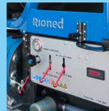
Hot water option 85°C