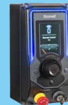
eControl+ control panel (with RioMote remote control)