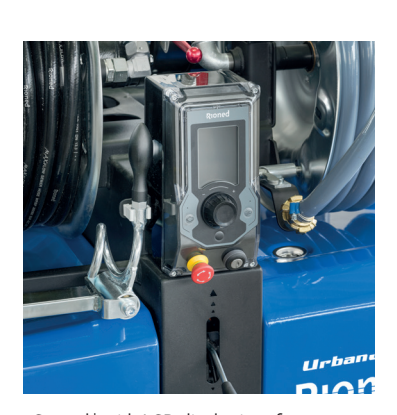
e Control^+ \ with \ LCD \ display \ interface