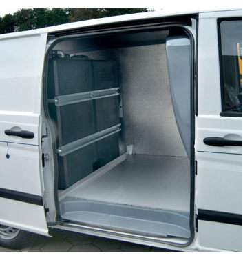
Compact built, leaving space for camera and tools