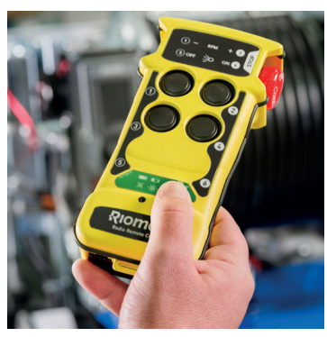
RioMote 5 channel radio remote control included

By using the latest technology Rioned has developed a new type of lightweight high pressure sewer hose with a larger inner diametre. This optimizes the flow inside the hose and reduces pressure loss significantly without compromising the working or burst pressure.